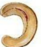
F: Longitudinal Tear (short)