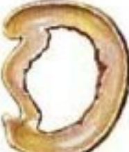
Longitudinal Tear (displaced bucket-handle)