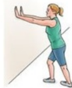
Standing calf stretch