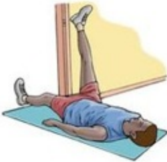
Hamstring stretch on wall