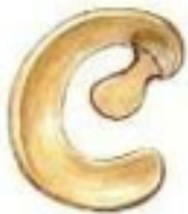
B: Flap Tear