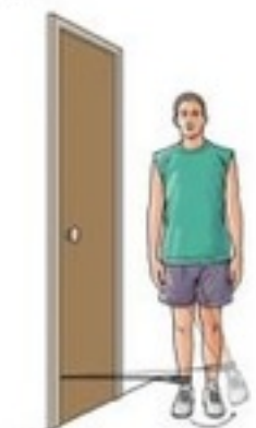
Knee stabilization: D