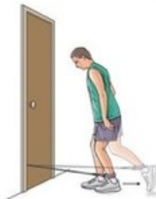
Knee stabilization: A