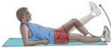
Straight leg raise