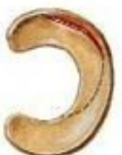
D: Peripheral Tear