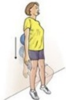
Wall squat with a ball