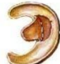
Displaced Flap Tear (horizontal)