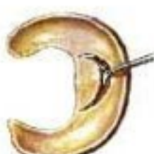
E: Horizontal Flap Tear