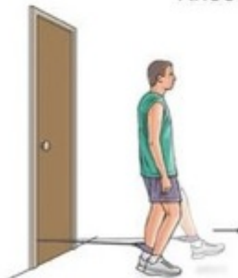
Knee stabilization: C