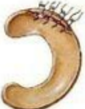
Repaired Peripheral Tear