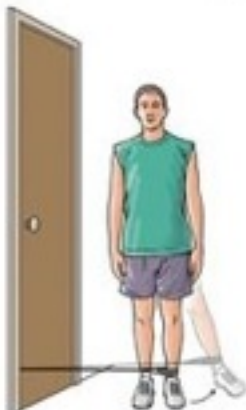
Knee stabilization: B