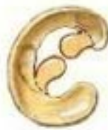
Double Flap Tear