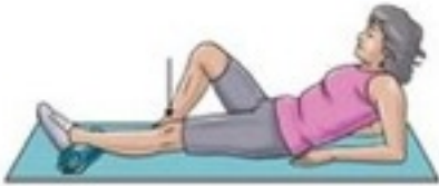
Passive knee extension