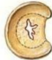
C: Discoid Meniscus