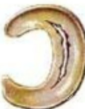
Longitudinal Tear (long)